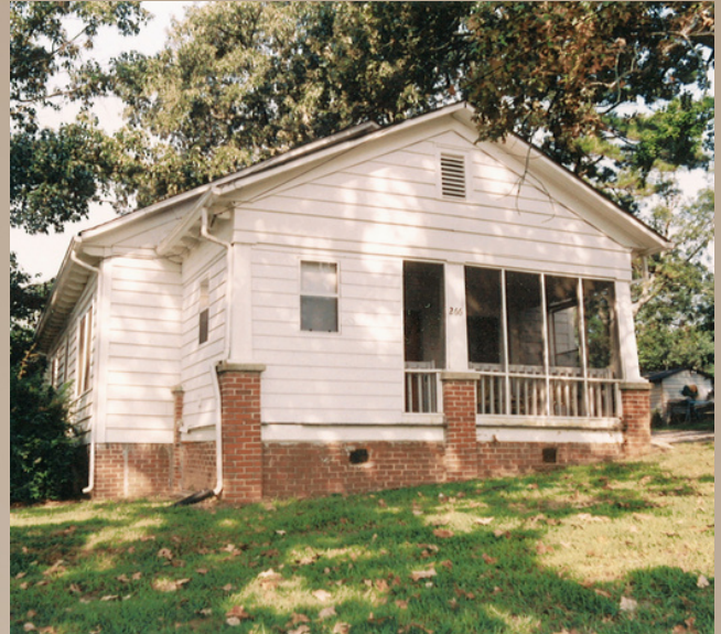
The original Rainbow House (1991)