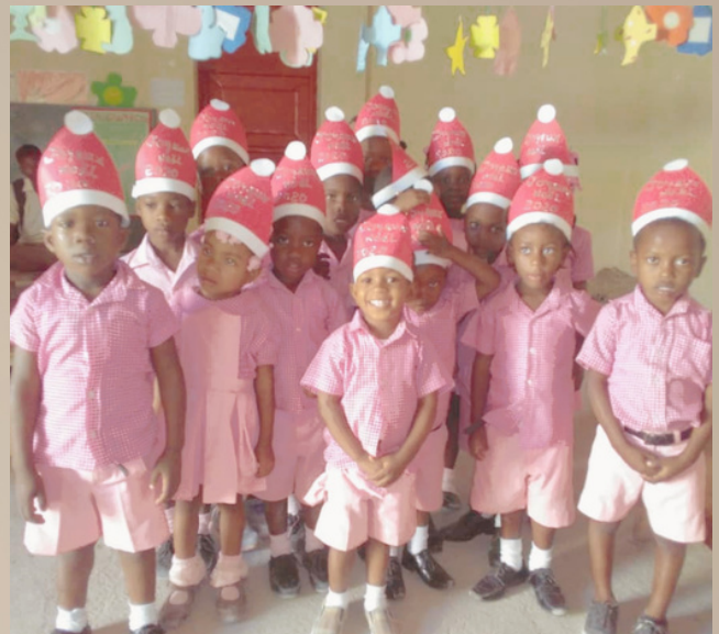
Schoolchildren from St. Joseph d'Armathée, Gressier, Haiti

In 2007, Christ Church began providing twice-yearly clinics for two communities in Haiti with a partner parish. Between 2008 and 2016, the clinics served between 750 and 900 patients every six months. In 2015, Haiti Companions became an independent charitable organization. In one year, it serves nearly 3,000 patients. Christ Church continues to support the parish and school of St. Joseph of Arimathea.